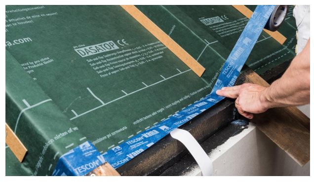
7. Stick the joint

After the sealant has fully dried, seal the refurbishment vapour check in an airtight manner using TESCON VANA, for example.