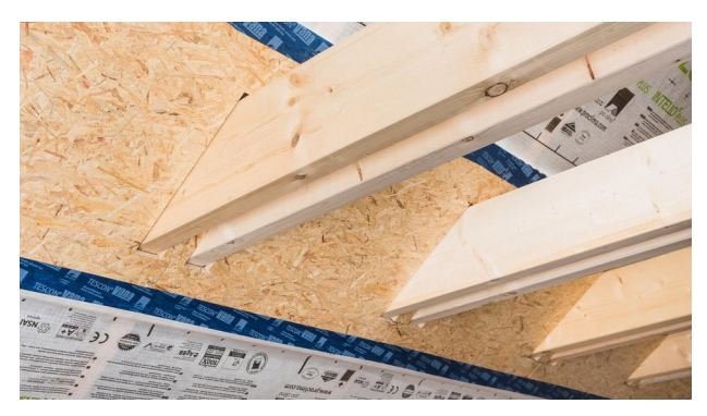
1. Initial situation