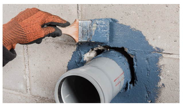
14. Paint the subsurface

Apply AEROSANA VISCONN FIBRE with a thickness of at least 1 mm (40 mils) around the hole and pipe.