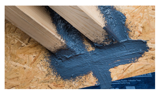
9. The finished joint at a double collar tie penetration

Areas that are difficult to access can also be sealed conveniently using the spray method.