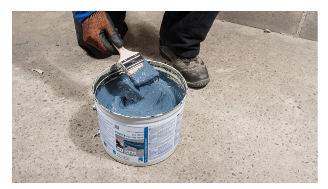
1. Stir the product

Before application from the tin: stir thoroughly.