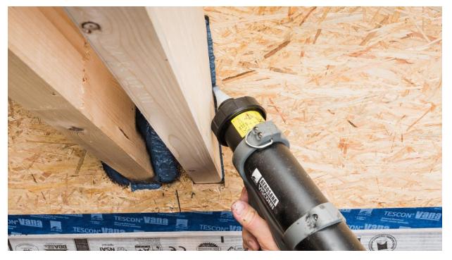
5. Fill the joint

Fill the joint with a sufficient amount of AEROSANA VISCONN / FIBRE.